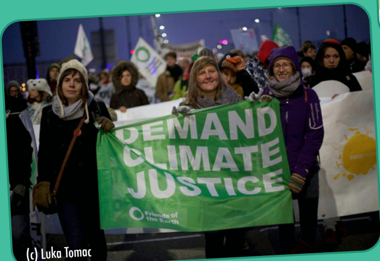
Power to the people, not the polluters!, System change, not climate change - can you hear the people sing?