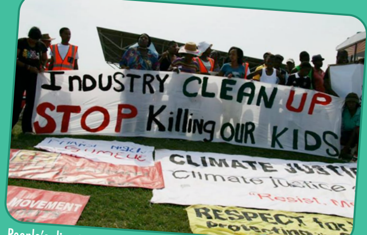
People's climate camp in Durban