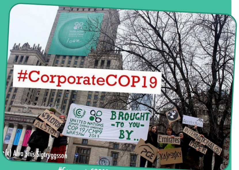
#CorporateCOP19: action outside the conference center

In protest at the unprecedented level of dirty corporate sponsorship at this year's UN climate negotiations, young people inside and outside the conference centre joined forces to reclaim the negotiations. The sponsors this year were some of Europe's biggest corporations and polluters such as ArcelorMittal, BMW and Emirates, as well as Polish fossil-fuel giants PGE and Lotos Group.