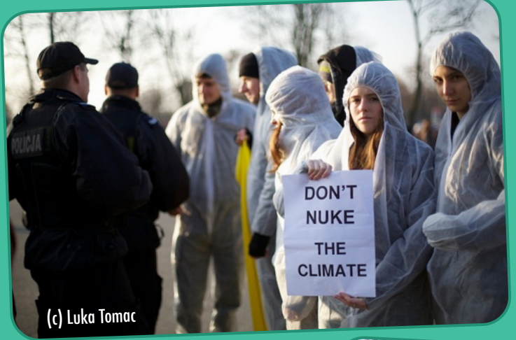
Don't nuke our climate!

Tug of war: coporate lobbyists against civil society